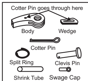
Parts of Cool Rudder Wedgie (CRW).